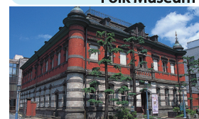
i. Akarenga (Red Brick) Folk Museum

A western style building, which was the former headquarters of Akita Bank in 1912.(National Important Cultural Property)Memorial Hall for Akita born woodblock painter Katsuhira Tokushi, annexed within the memorial house of hammering artist Sekiya Shiro, who has been designated as a Living National Treasure [Exhibition hours]9:30~16:30 [Closed]Year-End and New Year's holidays and exhibition transition periods