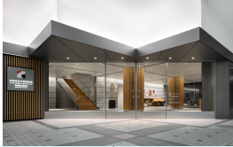
a. Senshu Museum of Art

In addition to the permanent exhibition of Western-style paintings and Akita Ranga from the late 18th century, and Kenzo Okada's Western paintings based on traditional Japanese aesthetics, the museum also holds special exhibitions showcasing outstanding artwork from both Japan and abroad. [Exhibition hours]10:00~18:00 [Closed]Year-End and New Year's holidays, exhibition transition periods and inspection days