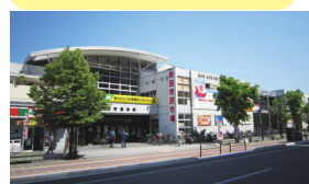
j. Akita Citizen's Market

The Akita Citizen's Market is a market located near Akita Station. The market is packed with the seasonal products, including local fresh seafood, edible wild plants, mushrooms, and fruit. About 60 stores are located inside. [Office hours]5:00 - 18:00 *It depends on the store. [Closed]Sundays (Subject to change during peak seasons)