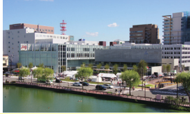
b. Area Nakaichi

"A hub for culture and exchange blessed with water and foliage, where visitors feel comfortable" Themed as a city oasis to accompany Senshu Park, it is arranged decoratively with commercial facilities, an exchange hall, the Prefectural Museum of Art, a plaza, parking lots, and a residential area. The base of creating liveliness in city center.