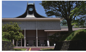
c. Cultural Creation Center

There is an open space people can freely visit, and a studio where various cultural activities take place. Also provided are chances for new meetings and for residents to foster their creativity. Support is also enacted for information distribution, an environment conducive to activities, and more. [Open hours]9:00~21:00 [Closed]Tuesdays (If Tuesday is already a holiday, then the following day), Year-End and New Year's holidays