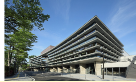
d. Akita Arts Theatre Mille Has

New arts theatre equipped with large, medium and small halls, studios, practice rooms, as well as a restaurant and terrace offering casual spaces to relax, interact with arts and culture, and connect with people.