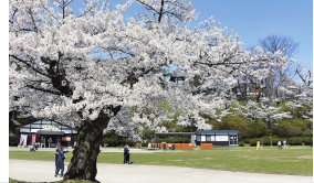
e. Senshu Park

Park located on the remains of Kubota Castle built by Lord Satake. Enjoy the scenery throughout the seasons with cherry blossoms and azaleas in spring, lotus in summer, colorful leaves in autumn, and snow binding on the trees in winter. *Akita Inu Fureaidokoro in Senshu Park [Open]May.5-Nov.4