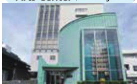
g. Folklore and Performing Arts Center (Neburinagashikan)

Introduces Akita City's folk events, arts, and more, such as the Kanto Lantern Festival and divine Bangaku dance. You can also try balancing a Kanto lantern pole. [Exhibition hours]9:00~16:30 [Closed]Year-End and New Year's holidays